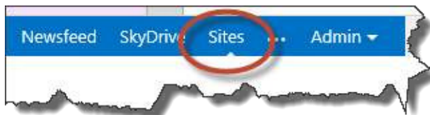
Figure 1 – select Sites from the menubar

Note Chrome and other browsers do not work well (if at all) with SharePoint Online.