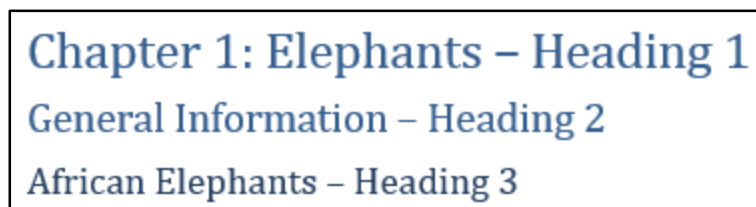
Figure 3 - Heading Styles

Note: There are up to nine multilevel numbered Heading Styles available. Below is a sample of Headings 1 through 3.